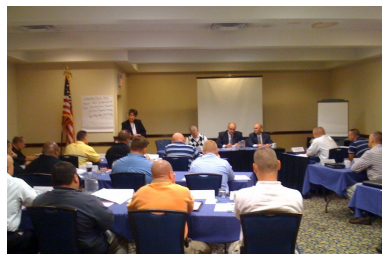
STEP attendees participate in a Contemporary Issues in Law Enforcement Panel discussion.