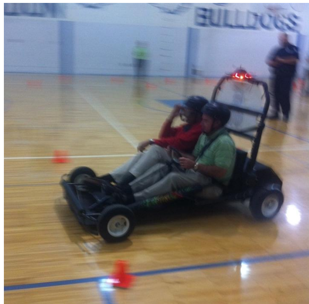
Westerville Citizens Police Academy students drive a go-cart that simulates impaired driving.

Westerville PD currently has 142 adult volunteers and 42 child volunteers who participate in various programs. The number of involved citizens is much greater, approximately 500, when members of neighborhood watch organizations are included. Having such a large group of civilians affiliated with the police department is not only beneficial for those who volunteer or participate in specific programs, the initiatives have a lasting positive impact on the entire Westerville community. Community policing is an effective way to “reduce polarization that sometimes exists between police and citizens” by increasing the level of trust